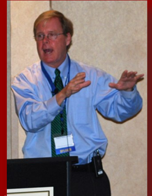
Author, Speaker, Consultant

The Teens Today program focuses on community building and exploring the role all adults have in helping keep teenagers safe. This can be held as a daytime or evening interactive seminar for administrators, faculty, and staff.